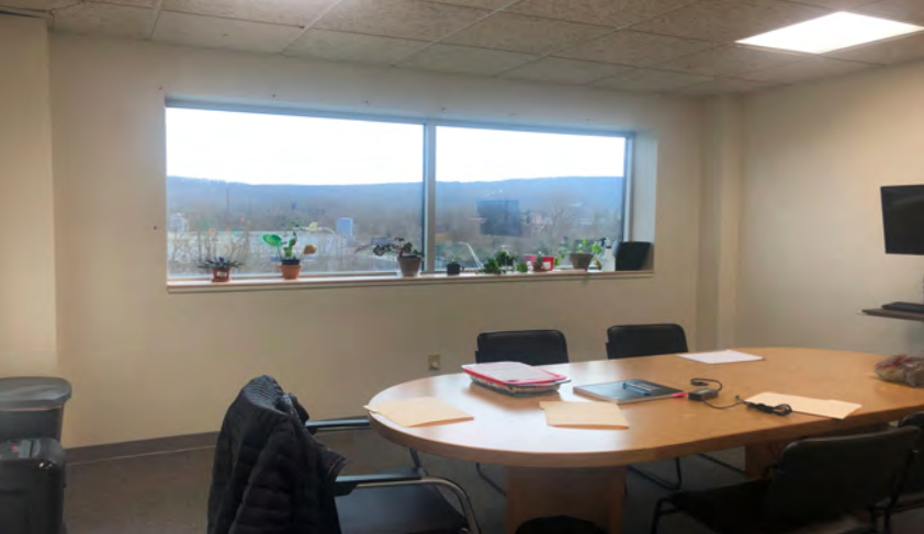
For more information, please contact

7\]d'A]Yfg 610.360.6604 cmiers@MarkwardGroup.com Cpp'Mhpg''' 610.295.6602 akline@MarkwardGroup.com